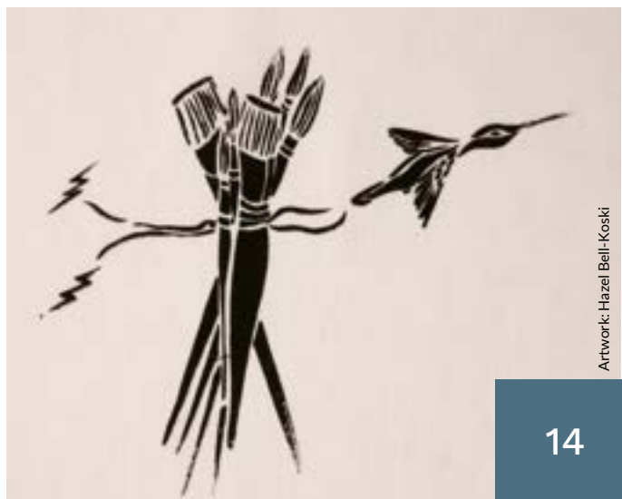
Artwork: Hazel Bell-Koski

For today—and for the generations to come.